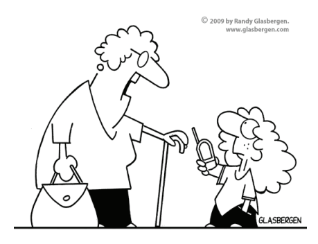
"Wireless communication is nothing new. I've been praying for 75 years!"

the Rosary, or night prayer. Our days are meant to be united to our God in prayer. Prayer truly expresses who we are, children of God. Then flowing from our prayer... are our Christian acts and good deeds... springing our prayers into action! We must say our prayers and also do our prayers!!!